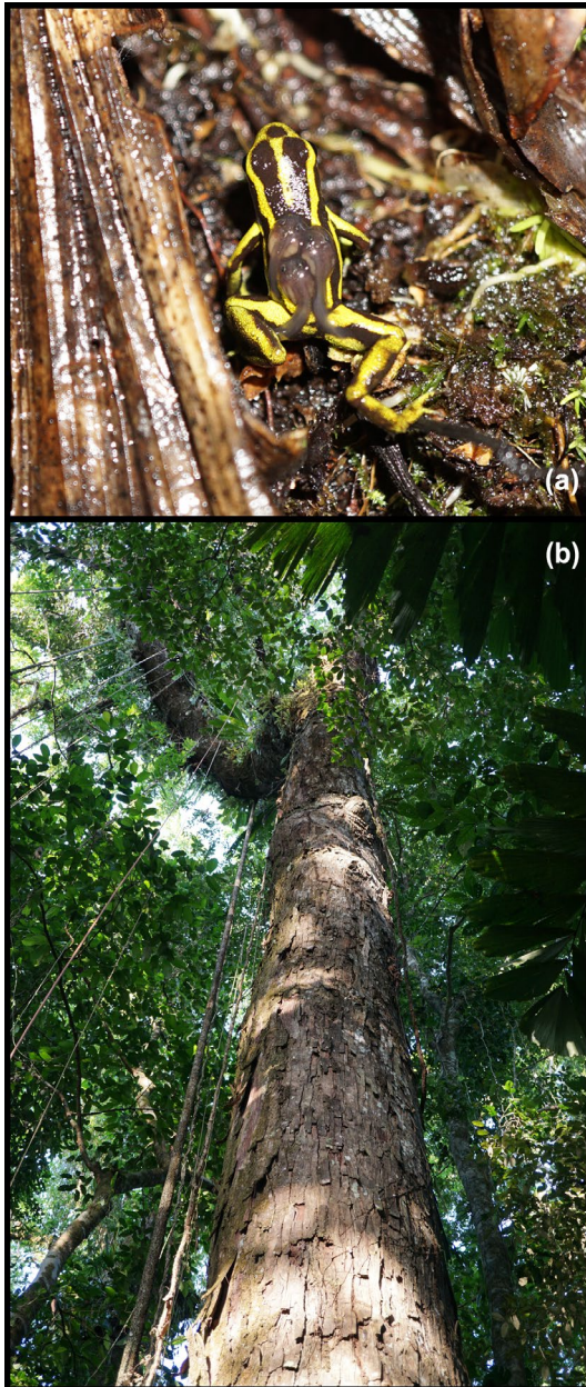
FIGURE 1 a) An individual A. fulguritus encountered in the wet season at 22 m aboveground moving up through a patch of sodden detritus and observed eating a microscopic prey item. Three tadpoles sit on the back of the individual, to be transported to a water filled epiphyte nursery. b) The Anacardium excelsum (Espavé) tree at which the individual in (a) was found. Diameter at breast height = 1.5 m; tree height = 42 m.